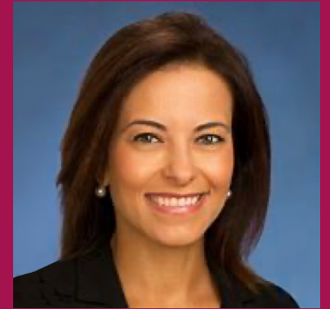
Dina Powell McCormick

We are so excited that you are here and we are wishing you the best of luck!